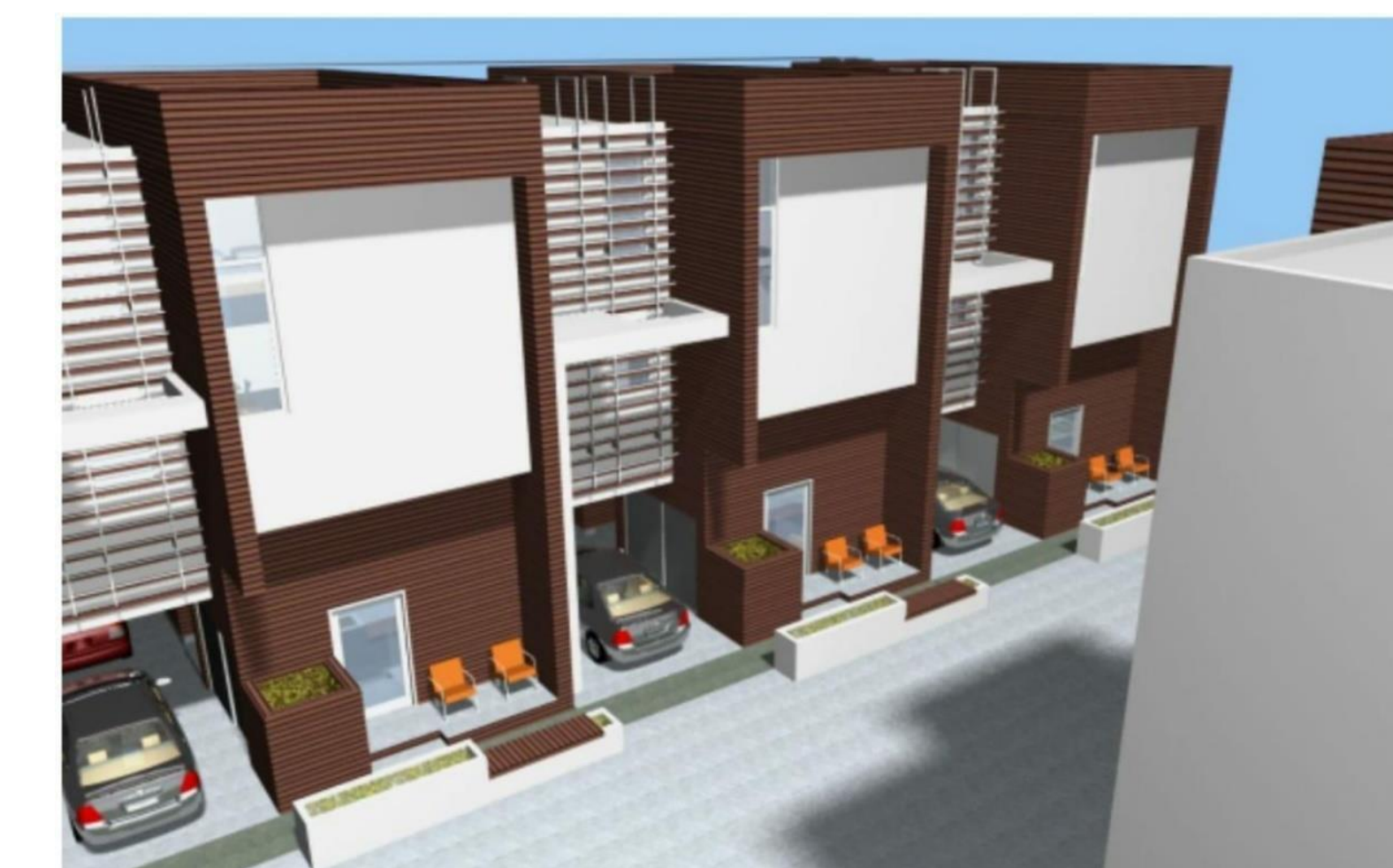
Figure 4: Proposed Housing Structure

If the project were to be done, it will provide the Maternillo Community with a lot of growth, employment opportunities, better education, local and foreign tourism and so much more. It is understood that the proposed project has a massive potential and value to Fajardo and all of Puerto Rico. Following the correct Civil Engineering Codes, Transportation Manuals, Environmental Guidelines and other regulations, this project will be a successful impact for the good of Puerto Rico. Figure 4 shows the new housing structures proposed that the citizens will much enjoy. This is a complete project that includes all the phases of civil Engineering and will develop jobs, before, during and after the transition phases.