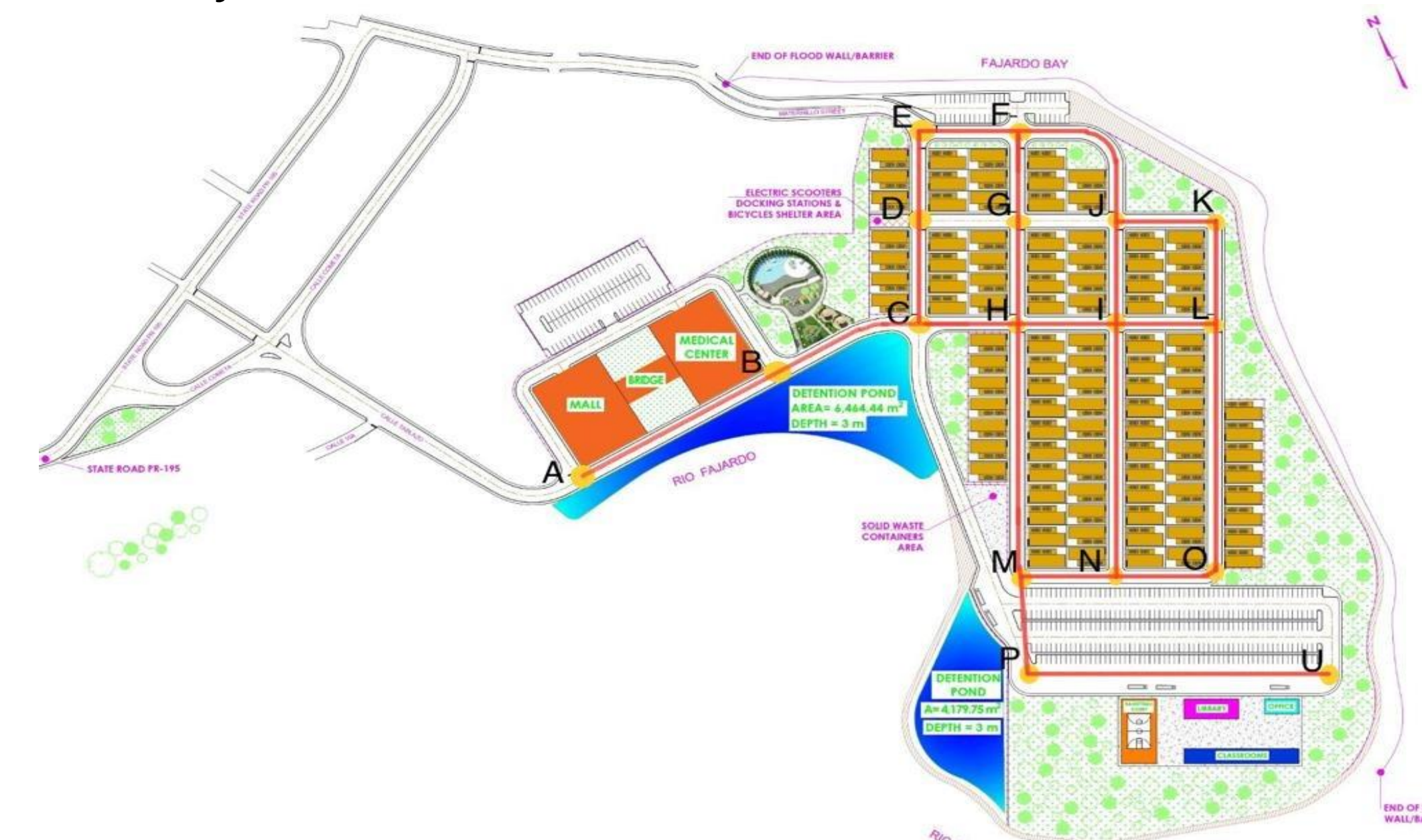
Figure 2: Proposed Site Plan