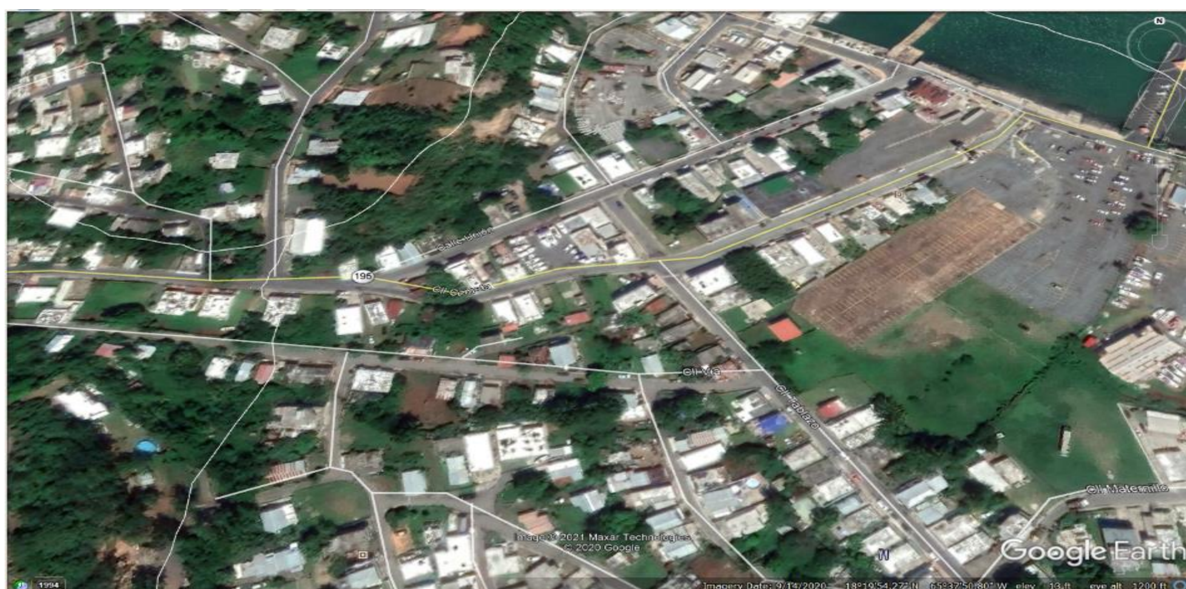
Figure 1: Maternillo Community, Fajardo, Puerto Rico

Evaluate the existing conditions of the community to upgrade and mitigate against natural hazards that contribute to its deterioration social-economically. Provide a channel and retention ponds to mitigate against the floods and storm surges, either caused by storms or out of typical rains, due to the Rio Fajardo's storage of passage. Another objective is to demolish existing structures and homes that are out of code and are in the way of the new site construction to build the new homes, commercial center and schools. Upgrade the streets from potholes and deterioration caused by storms and proximity to salty sea water and river water, which advance the corrosion process. In green areas, construct a park for pets, and citizens to enjoy. Overall, reconstruct the Maternillo Community to transition it to a smart and ideal community for Puerto Rico.