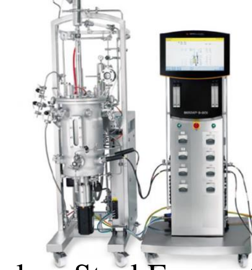
Figure 3: 30L Stainless Steel Fermenter with D-DCU unit [4]

The selection of equipment for a fermentation laboratory is critical for the success and efficiency of biotechnological and biopharmaceutical processes. The equipment, including fermenters, bioreactors, and supplementary tools, is fundamental in facilitating the growth and manipulation of microorganisms to produce valuable compounds. Key considerations include vessel size, agitation mechanisms, control systems, and sterility features, all of which must meet the specific requirements of the fermentation processes. Additionally, compatibility with automation systems, data acquisition software, and regulatory standards is essential for smooth integration into workflows and compliance with industry guidelines. Proper equipment selection optimizes process performance, reduces operational risks, and accelerates scientific discovery and innovation. Figure 3 illustrates a suitable fermenter with an appropriate automation system (D-DCU) that meets the laboratory's operational and process optimization needs.